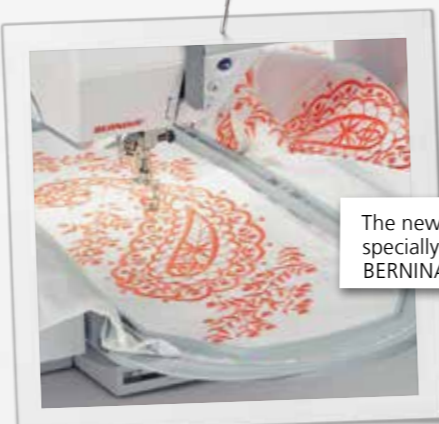
The new Maxi Hoop was specially developed for the BERNINA 7 Series.

Specially designed for the BERNINA 7 Series, the new Maxi Hoop holds embroidery designs with a maximum area of 400 x 210 mm. The Maxi Hoop is available as an optional accessory.