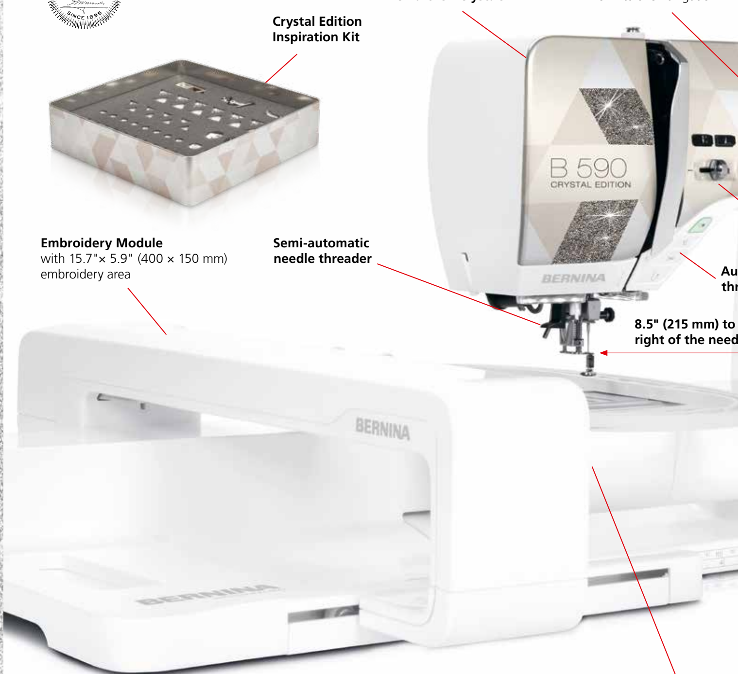
8.5" (215 mm) to right of the needle